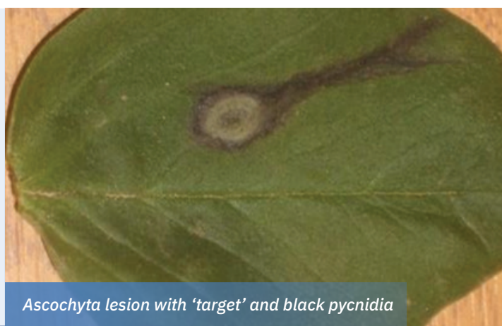
Ascochyta lesion with 'target' and black pycnidia

This disease is easily preventable by using disease free seed and good rotations. Volunteer beans (in a following cereal crop) will almost always display the characteristic symptoms on their leaves and later, their stems. The main yield effect is from lodging as the disease weakens the stem. Control with fungicides is rarely warranted in spring beans, but is quite common in autumn drilled crops. All Seedtech beans are certified Ascochyta free by DAFM.