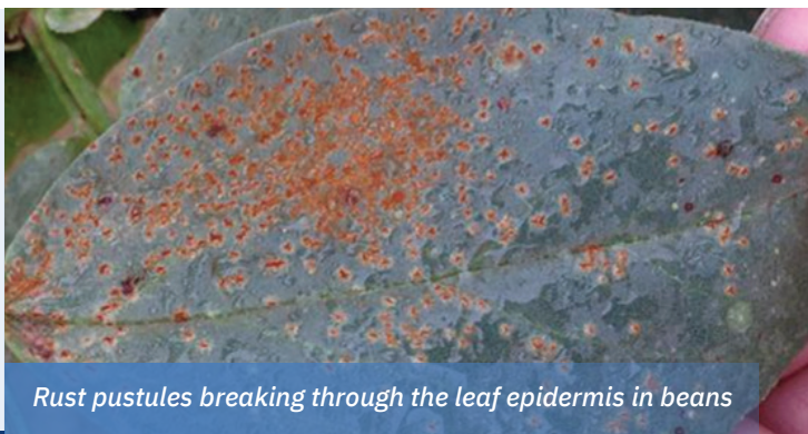
Rust pustules breaking through the leaf epidermis in beans

Usually, rust infection occurs too late for serious damage to occur. Infection during flowering and pod set is more damaging.