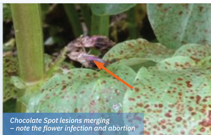
Chocolate Spot lesions merging – note the flower infection and abortion

Autumn sown beans are more likely to suffer yield losses, especially where the plant population is high and the crop becomes tall.