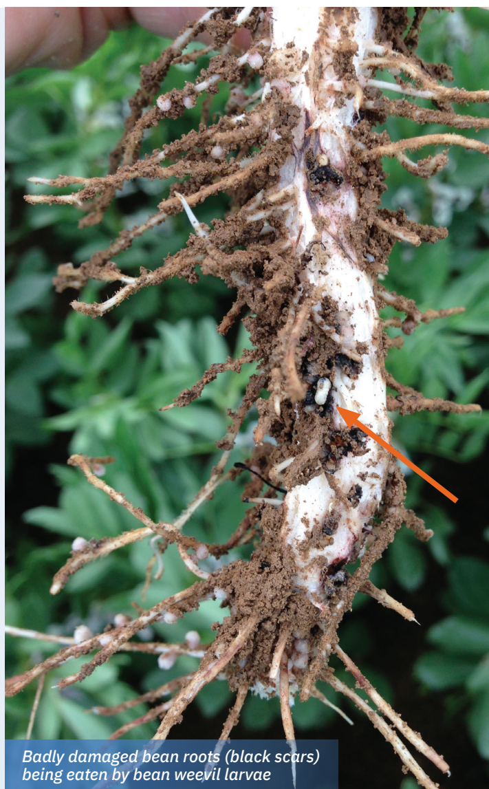
Badly damaged bean roots (black scars) being eaten by bean weevil larvae

Look out for fields where peas or beans have been grown in the past as they are most likely to have high populations of the weevils surviving in hedges etc. Pheromone traps can be placed along hedgerows to give an indication of adult numbers.