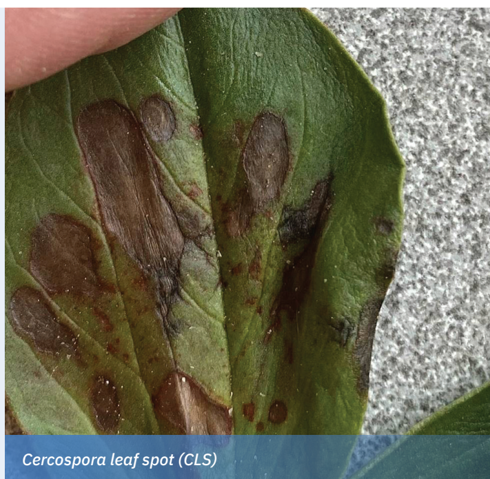
Cercospora leaf spot (CLS)

It is caused by the fungus Cercospora zonata and is soil-borne. Cercospora spread is limited in warmer weather (May/June) and specific fungicides may not be warranted. Cercospora lesions are more angular and darker than Chocolate Spot and often have concentric circles, whereas Chocolate Spot does not. It differs from Ascochyta lesions in that Cercospora does not have pycnidia (dots) in the lesion. Generally, Cercospora lesions develop early in the season, Chocolate spot is later. Herbicide and frost damage can be confused with fungal diseases.