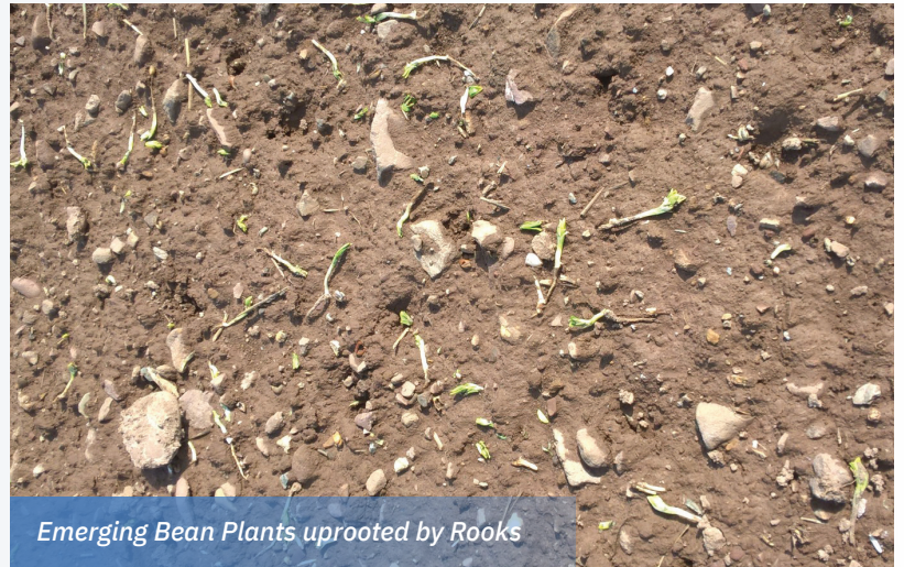
Emerging Bean Plants uprooted by Rooks

Drilling too early increases the risk of rook and crow damage – this can be alleviated by deeper drilling depth (e.g. to 10 cm or 4”) but crows will ‘improvise’ and pull up emerging beans if food is scarce.