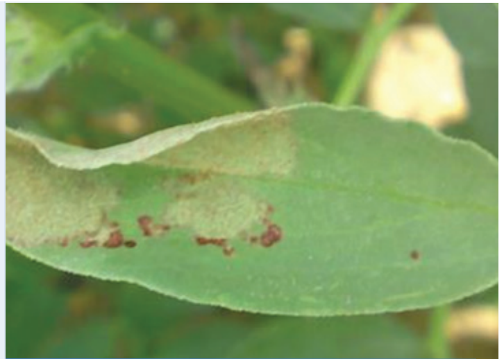
Early Downy Mildew symptoms – brown/grey fungal growth

Varietal resistance is important. Lynx and Fanfare have good mildew resistance on the DAFM list 2021. NIAB/PGRO recommend a fungicide should be applied if Downy Mildew is seen on >20% of plants especially if present before flowering.